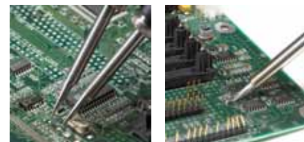
Precision Tweezers rework SMD components with fine dimension to large blade geometries, while the Soldering Tip hand-piece has exceptional power for production soldering.

TAP into OK International TRAINING Advantage APPLICATION Advantage PRODUCTIVITY Advantage Find out more at www.beasuperproducer.com