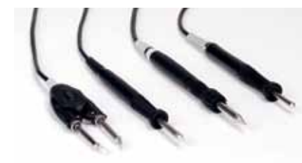
MFR-1100 Series Hand-pieces A. MFR-H4-TW Precision Tweezers B. MFR-H6-SSC SSC Soldering Cartridge C. MFR-H2-ST Soldering Tip D. MFR-H1-SC Soldering Cartridge